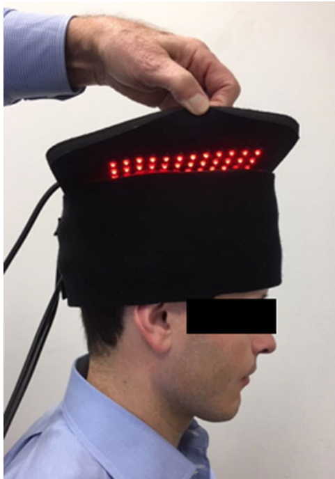
FIG. 1. Sequentially pulsed red/near-infrared device.

pad circled the skull and the other pad covered the top of the head, providing a total coverage area of 519 cm 2 with an average power density of 6.4 mW/cm 2 , an average energy density of 7.7 J/cm 2 , and a peak power density of 18.3 mW/cm 2 (Fig. 1). Published scientific evidence suggests that pulsed light is superior to continuous light application; therefore, red/